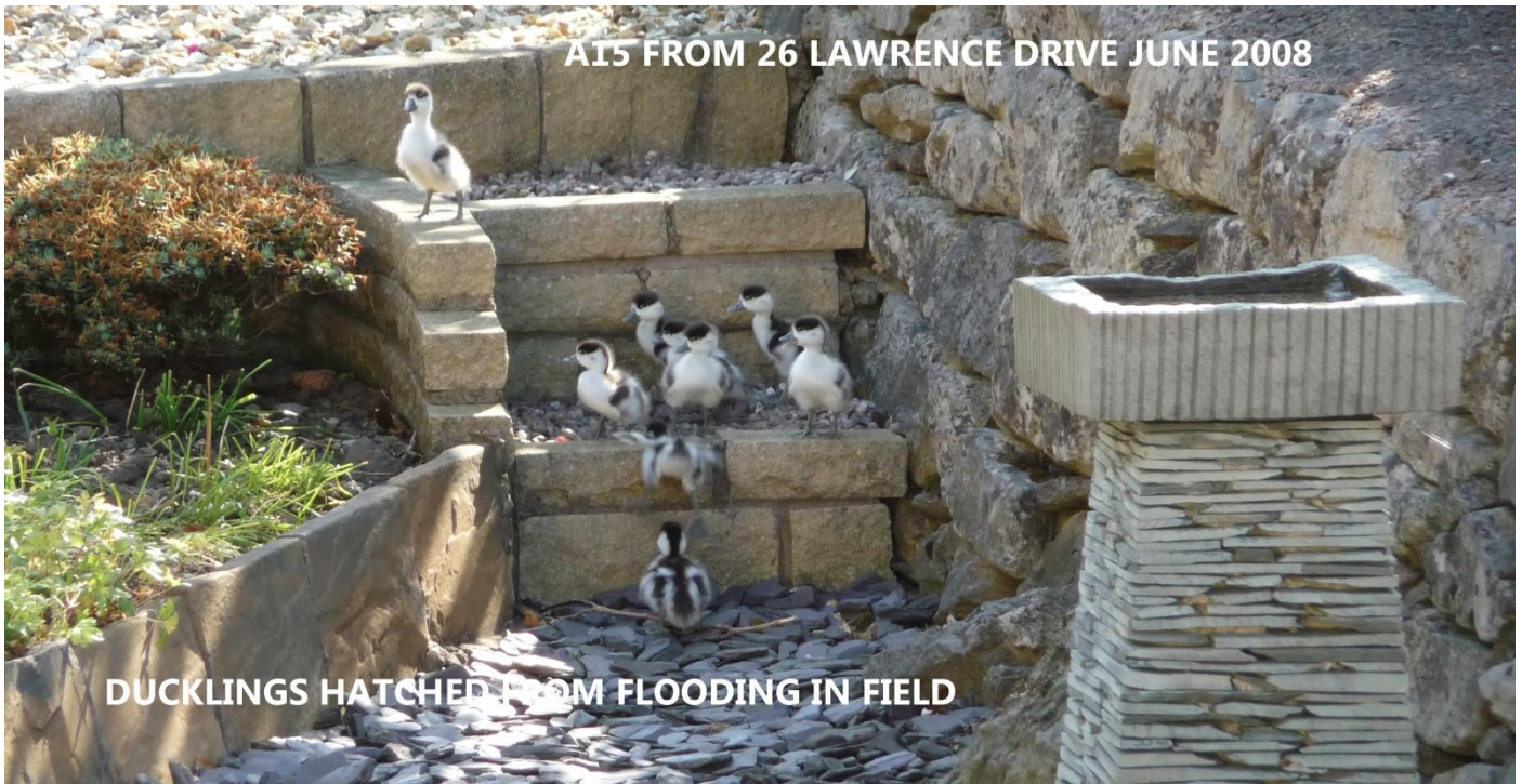
A15 FROM 26 LAWRENCE DRIVE JUNE 2008

The flooding in 2008 was so extensive and long lasting that a pair of ducks bred as evidenced by the ducklings in our garden. Obviously they attracted my photographic interest more strongly on that earlier occasion when the prospect of building was not on the local agenda.