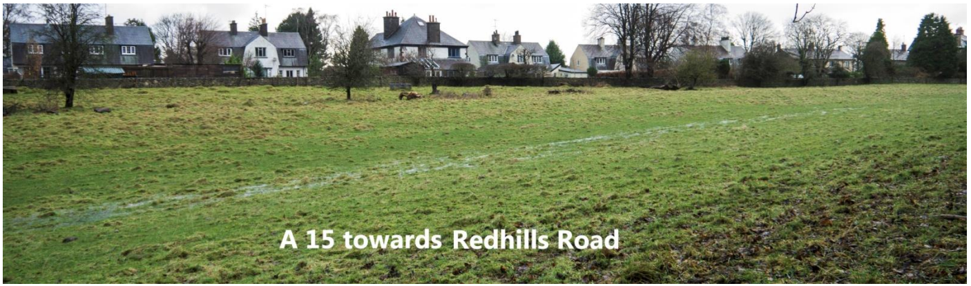
A 15 towards Redhills Road

The flooding in 2008 was so extensive and long lasting that a pair of ducks bred as evidenced by the ducklings in our garden. Obviously they attracted my photographic interest more strongly on that earlier occasion when the prospect of building was not on the local agenda.