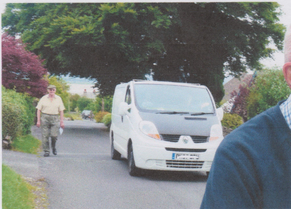
walkers & cyclists lower Hollins Lane