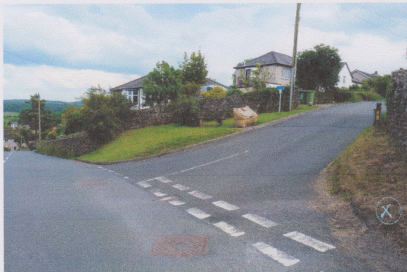
Entry from Briary Bank