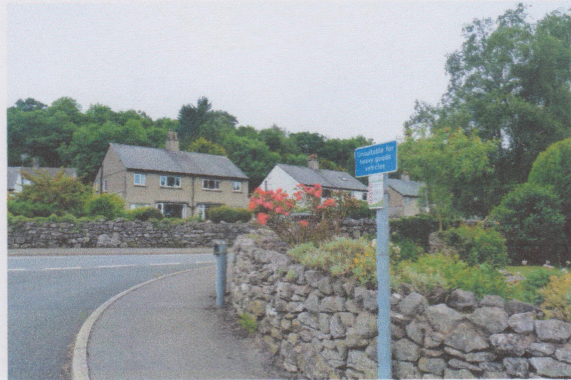
Entry from Silverdale Road