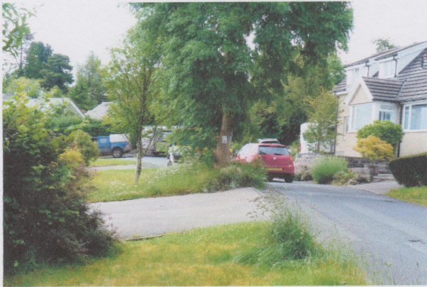
junction of Hollins Lane & Plantation Ave.