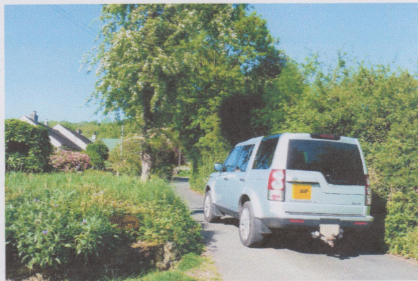
blind bends & passing places