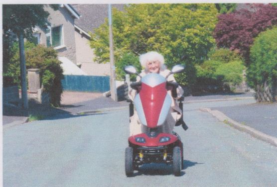
Mobility scooter above blind bend on Swinnate Rd.