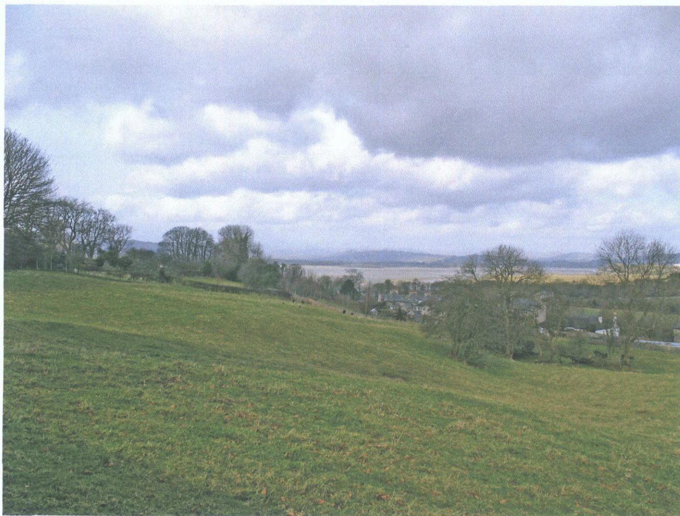
View across Estuary to Lakeland Hills