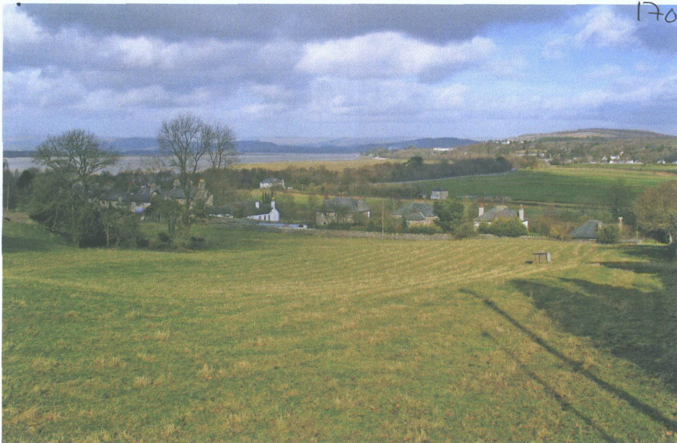
View to Carr Bank and Storth