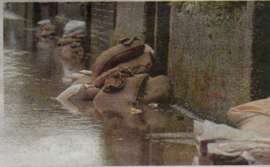
IN VAIN: Sandbags fail to keep out the flood water in North Lonsdale Road JOE RILEY REF: 0512073