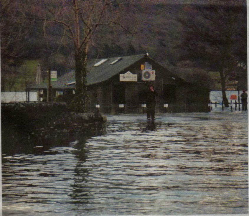
CONISTON WATER: The Bluebird cafe is surrounded by water at Coniston KERRIE HARVEY