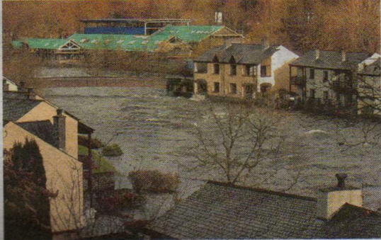
FLOODING: Parts of Backbarrow underwater JOE RILEY REF: 0512119