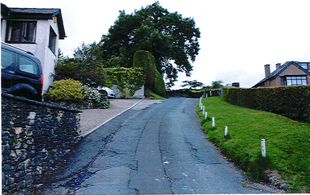
Mowings Lane - 1 in 4 Section.jpg