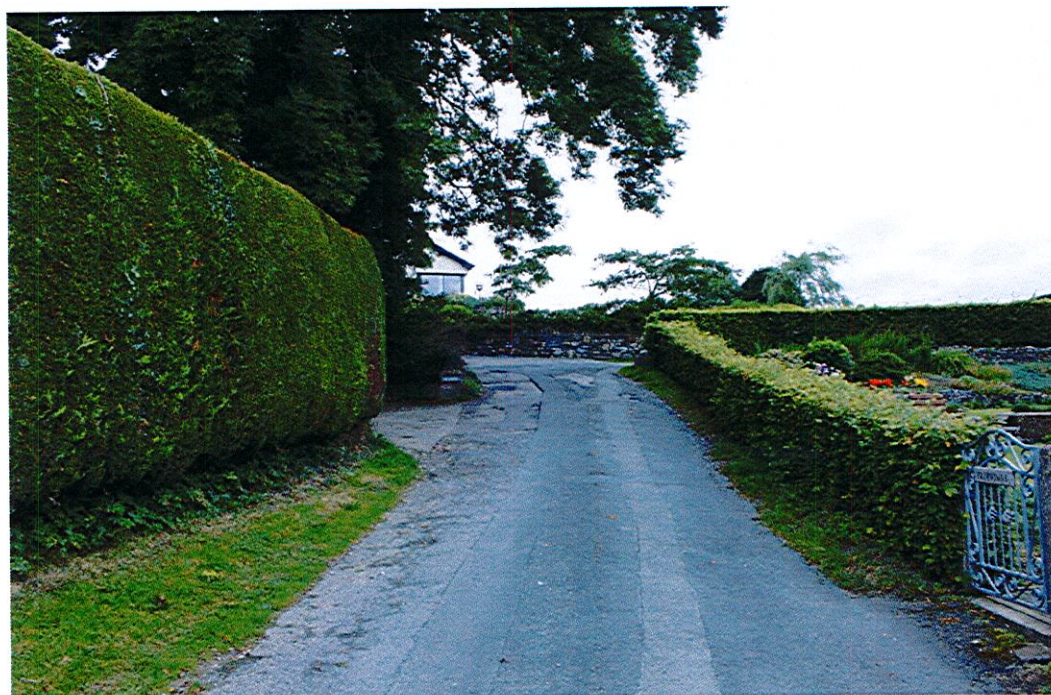
Mowings Lane - Approach To Blind Left Hand Corner.jpg