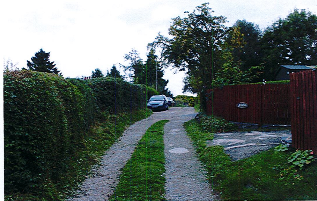
Mowings Lane - Approach to Acresfield & The Bungalow E ...