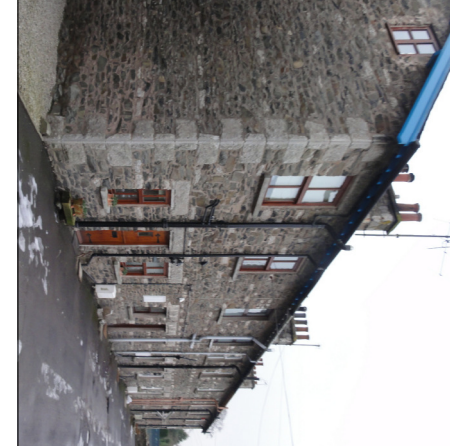
Local built form