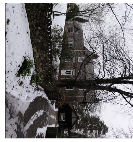
Local built form