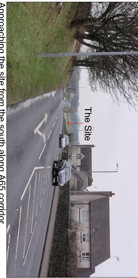
Approaching the site from the south along A65 corridor