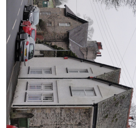
Local built form