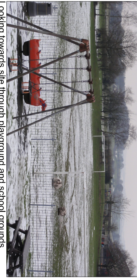
Looking towards site through playground and school grounds