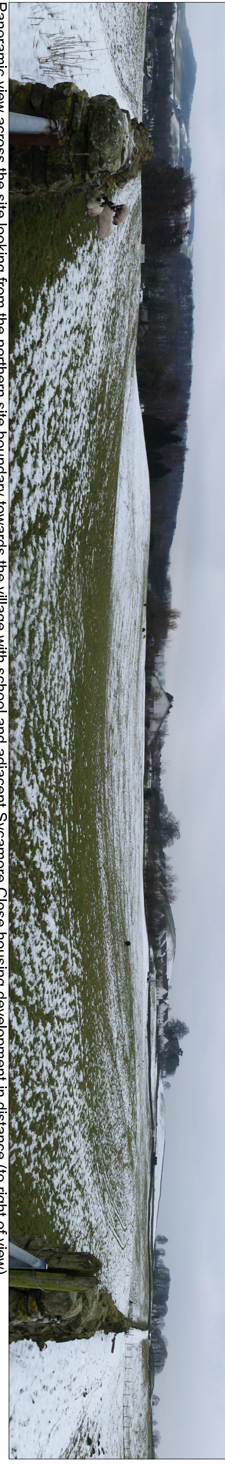
Panoramic view across the site looking from the northern site boundary towards the village with school and adjacent Sycamore Close housing development in distance (to right of view)