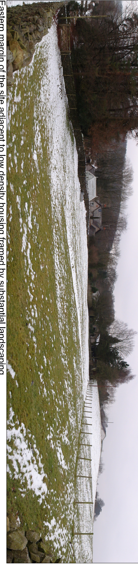
Eastern margin of the site adjacent to low density housing framed by substantial landscaping