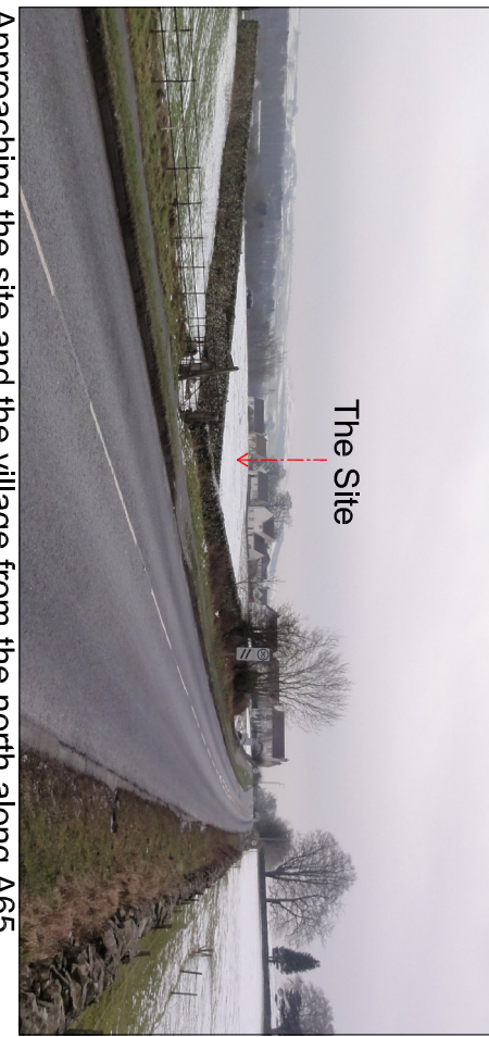
Approaching the site and the village from the north along A65